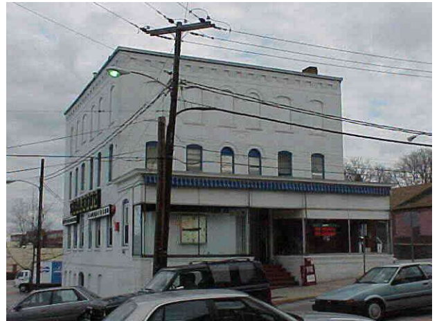
( https://images.vgsi.com/photos/NewLondonCTPhotos/A00/00/31/39.jpg )