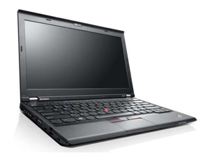
Lenovo Think Pad

In addition to the Lenovo Think Pads, grant funding has also been secured to purchase a mobile message board, much like the units already being used by the city, as well as a respirator fit test machine and portable radio batteries. These acquisitions assist us with both day-to-day operations, as well as when a disaster strikes New London.